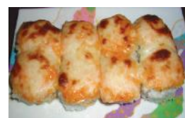
Pizza Roll 🌶️ In: Krab, Avocado Top: Spicy Mayo, Mozzarella Cheese

We strongly advise that you check all the ingredients in the roll prior to ordering. Food may take longer to prepare during busy times.