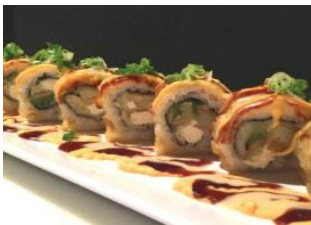
Golden Munch Roll (8 pcs) 🌶️ In: Sweet Potato Tempura, Zucchini Tempura, Cream Cheese w/ Spicy Mayo, Teriyaki Sauce, Green Onion, Sesame (Lightly Fried Tempura Style)