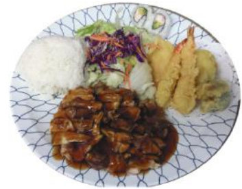
Chicken Teriyaki and Tempura