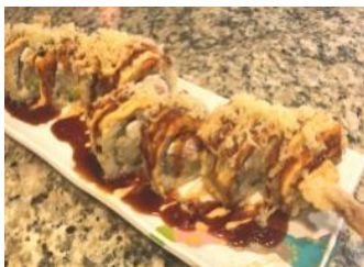
Chula Vista Roll 🌶️ In: Krab, Shrimp Tempura, Cream Cheese, Avocado w/ Eel Sauce, Crunchy on top, Sesame, Spicy Mayo