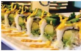
30th. St. Roll (8pcs) 🌶️ In: Spicy Albacore, Avocado w/ Spicy Mayo, Jalapeño