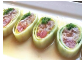
Protein Roll (No Rice, 6pcs) In: Tuna, Yellowtail, Salmon, Albacore, Green Seaweed. Out: Cucumber, Sesame, Soy Beans Paper w/ Ponzu Sauce.