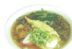
Hanaoka Special Udon