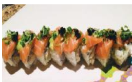
HANAOKA House Roll (8pcs) In: Krab, Albacore Top: Salmon, Avocado, Flying Fish Egg w/ Green Onion, Sesame, Ponzu Sauce