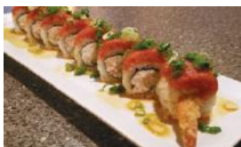
Hawaiian Roll (8pcs) 🌶️ In: Shrimp Tempura, Krab Top: Spicy Tuna, w/ Spicy Sauce, Green Onion, Spicy Mayo