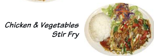
Chicken & Vegetables Stir Fry