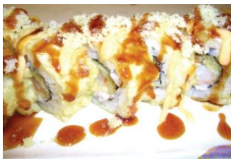
San Ysidro Roll 🌶️ In: Smoked Salmon, Cream Cheese, Avocado w/ Eel Sauce, Crunchy on top, Sesame, Spicy Mayo