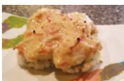
Baked Krab Roll In: Krab, Avocado Top: Krab w/ Creamy Sauce