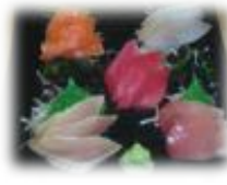
Sashimi Dinner (B)