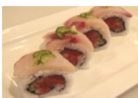
North Park Delight Roll (8pcs) 🌶️ In: Spicy Tuna, Avocado Top: Yellowtail, Jalapeño w/ Garlic Sauce, Sesame