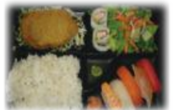
Tonkatsu and Sushi