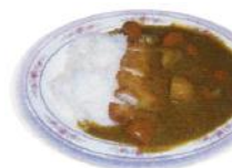
Katsu Curry Rice