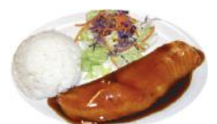
Grilled Salmon Teriyaki