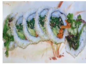
Veggie Roll (6 pcs) In: Green Seaweed, Avocado, Cucumber, Baby Radish, Burdock, Sesame