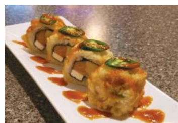
National City Roll 🌶️ In: Salmon, Cream Cheese, Avocado w/ Chili Sauce, Jalapeño, Sesame, Spicy Mayo