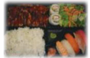
Chicken Teriyaki and Sushi