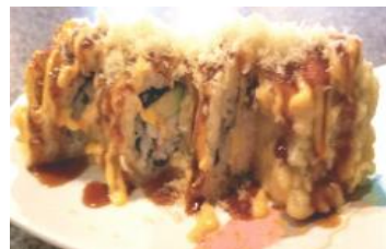
Bonita Roll 🌶️ In: Krab, Avocado w/ Spicy Mayo, Eel Sauce, Crunchy on top, Sesame