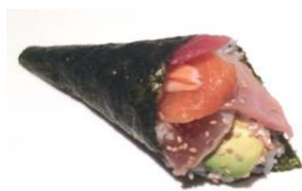
Mix Hand Roll

Krab, Tuna, Shrimp, Albacore, Salmon, Avocado, Sesame