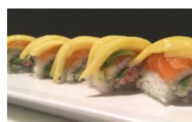
Tropical Mango Roll (8pcs) In: Krab, Avocado Top: Salmon, Avocado, Mango w/ Coconut Sauce

We strongly advise that you check all the ingredients in the roll prior to ordering. Food may take longer to prepare during busy times.