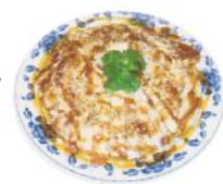
Chicken Teriyaki Don