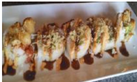
Calamari House Roll (6pcs) 🌶️ In: Fried Calamari, Spicy Tuna, Lettuce w/ Soy Beans Paper, Spicy Mayo, Eel Sauce, Crunchy on top, Sesame