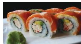
Sunrise Roll (4 or 8pcs) In: Krab, Avocado Top: Salmon, Avocado