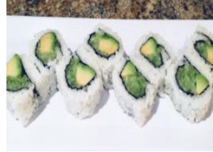
Avocado & Cucumber Roll (8 pcs) In: Avocado, Cucumber w/ Sesame