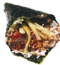
Eel & Cucumber Hand Roll

Krab, Tuna, Shrimp, Albacore, Salmon, Avocado, Sesame