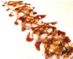
Vegetable Tempura Roll (6 pcs) In: Vegetable Tempura (Zucchini, Sweet Potato, Pumpkin) w/ Teriyaki Sauce, Sesame