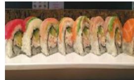
Rainbow Roll (4 or 8pcs) In: Krab, Avocado Top: Tuna, Avocado, Salmon, Albacore, Red Snapper, Shrimp