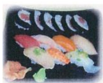
Sushi Dinner (A)