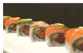
Tai-Dai Roll (8pcs) In: Salmon, Albacore Top: Red Snapper, Salmon, Avocado w/ Sliced Lemon, Ponzu Sauce