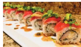
Ray at Night Roll (8pcs) In: Krab, Yellowtail. Top: Seared Tuna, Avocado w/ Green Onion, Sesame, Garlic Sauce