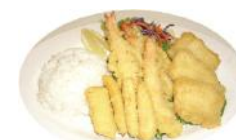
Fried Seafood Combo