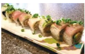
La Boheme Roll (8pcs) In: Spicy Yellowtail Top: Yellowtail, White Fish, Avocado, Green Onion w/ Garlic Sauce, Sesame