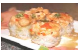
Baked Scallop Roll In: Krab, Avocado Top: Scallop, Masago w/ Creamy Sauce