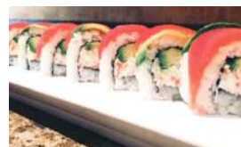
Sunset Roll (4 or 8pcs) In: Krab, Avocado Top: Tuna, Avocado