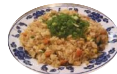
Chicken Fried Rice