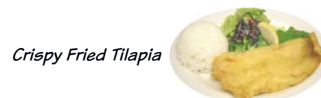
Crispy Fried Tilapia