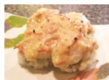
Baked Salmon Roll In: Krab, Avocado Top: Salmon, Masago w/ Creamy Sauce