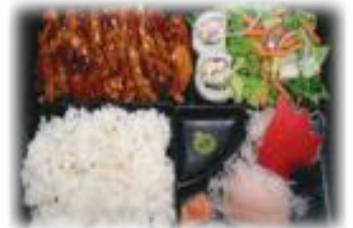
Sashimi and Chicken Teriyaki