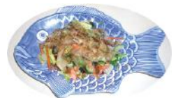
Salmon Skin Salad