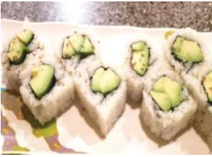
Avocado Roll (8 pcs) In: Avocado w/ Sesame